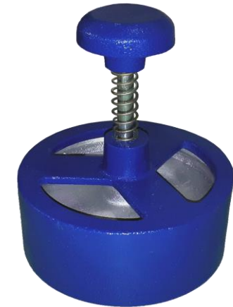
Patty Former 130mm (PU214)