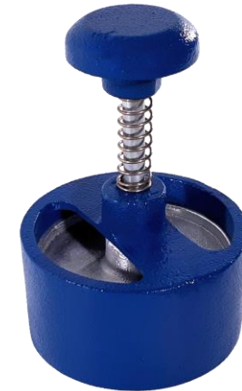
Patty Former 100mm (PU213)