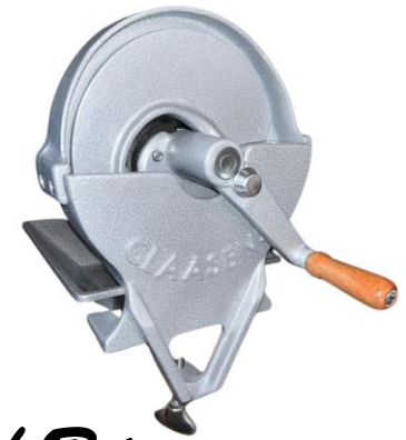
Hand Biltong Slicer Pro (HKP113)